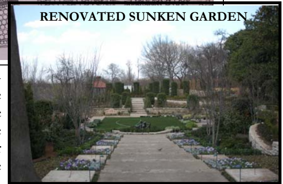
RENOVATED SUNKEN GARDEN