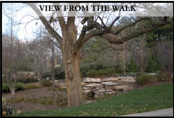
VIEW FROM THE WALK

This is such an exciting year for our Women's Council. The photos below, taken after the February 16 th winter meeting at the Arboretum show how near completion is the 1.7 acre Phase II expansion of "A Woman's Garden." Most of the hardscape and walkways are done, and much of the planting is complete. We invite every one of our members to come experience the beauty of this garden!