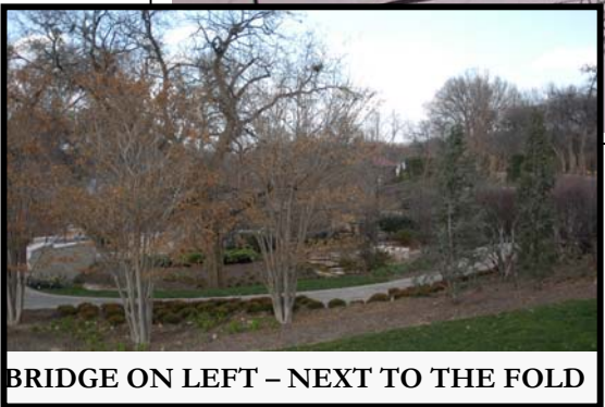
BRIDGE ON LEFT - NEXT TO THE FOLD