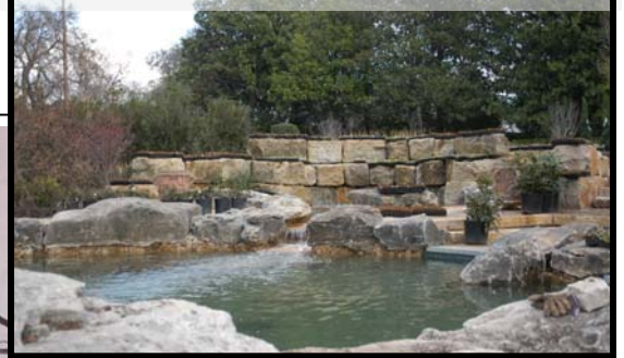
THE GROTTO (NEAR COMPLETION)

This is such an exciting year for our Women's Council. The photos below, taken after the February 16 th winter meeting at the Arboretum show how near completion is the 1.7 acre Phase II expansion of "A Woman's Garden." Most of the hardscape and walkways are done, and much of the planting is complete. We invite every one of our members to come experience the beauty of this garden!